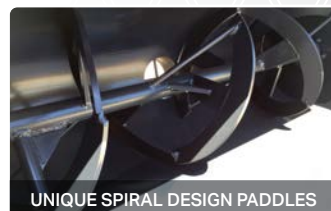
UNIQUE SPIRAL DESIGN PADDLES